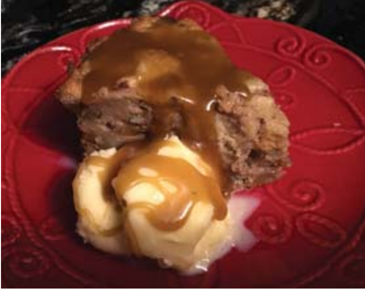
Cinnamon Apple Raisin Bread Pudding